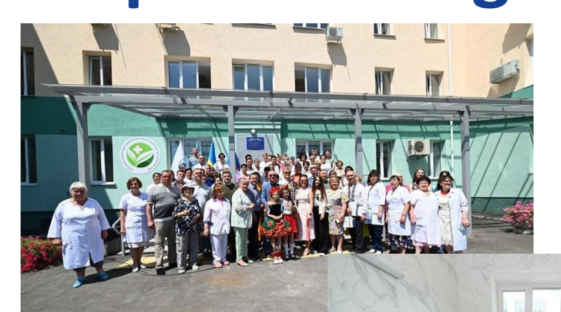
City Clinical Hospital No. 8 reopened in Odesa