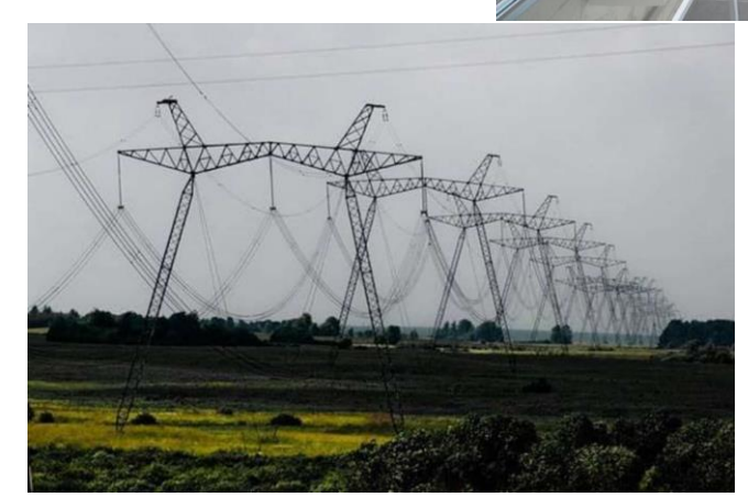
Rivne – Kyiv High Voltage Line 750 kV Zaporizhzhia– Kakhovska Line