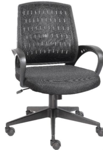
Ec- 034 4500/-