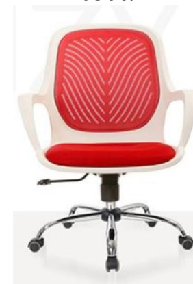
EC 043 5900/-