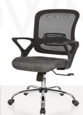
EC 040 5700/-