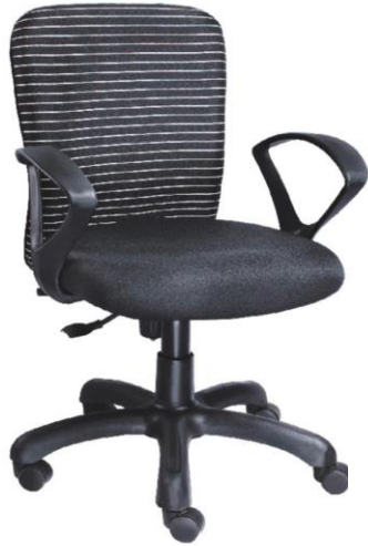
Ec- 031 4500/-