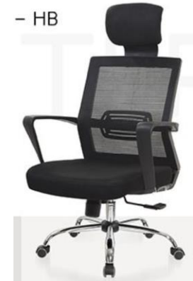
EC 039 6200/-