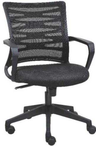
Ec- 033 4500/-