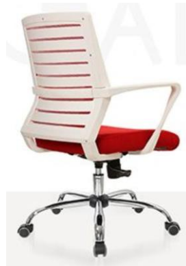
EC 041 6000/-