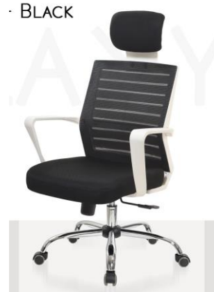
EC 037 7000/-