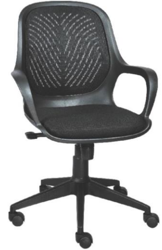
Ec- 032 5300/-