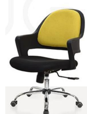
EC 044 5600/-