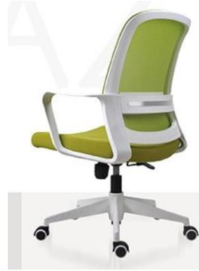
EC 042 6600/-