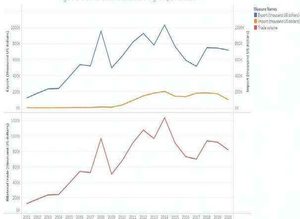
Figure 1: Ukraine-Saudi Arabia trade in goods, 2001-2020

Source : State Statistics Service of Ukraine