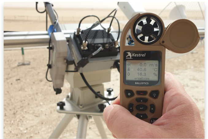
To +40 °C