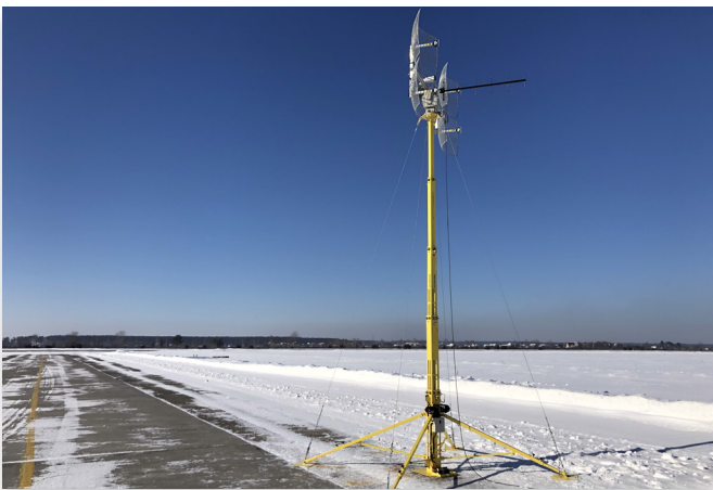
From -20 °C