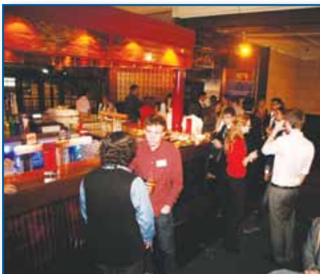
Students gathering before the dinner.