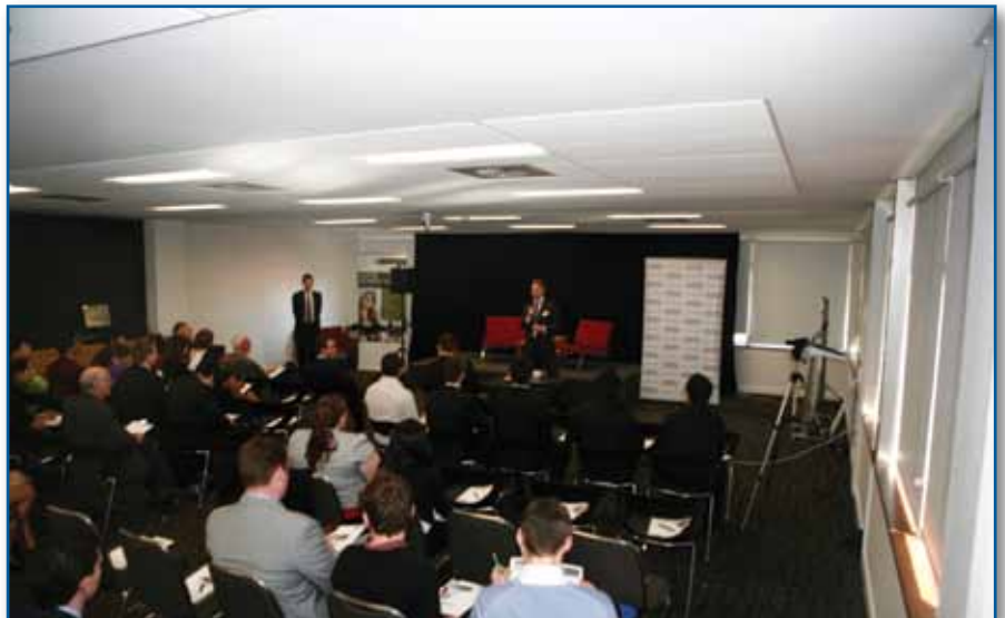
The Freedom Factory in "full production"!