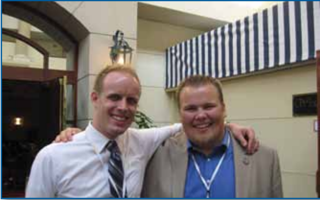
Paul with a fellow Cato attendee.

that industry willingly allowed itself to be regulated because it stabilised the financing aspect of business. The government regulation of this natural monopoly attempted to achieve target prices in line with demand and guarantee secure, long-term returns. She called this the regulatory bargain: industry was required to serve all customers within a given geographical service territory but, in return, it was insulated from the entry of other firms into the market.