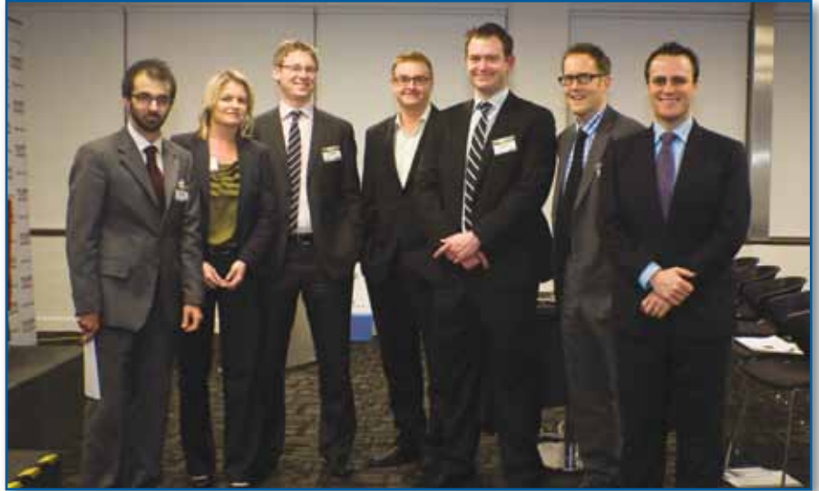
A top line-up of speakers at the Freedom Factory Conference 2011.