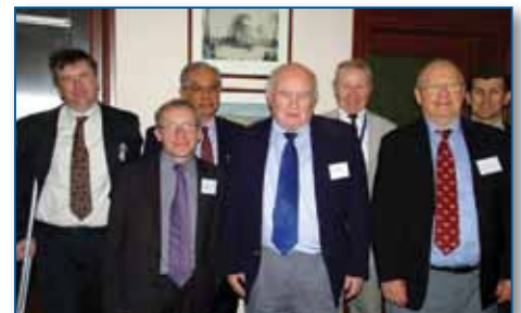
Speakers at the Freedom to Choose Conference.