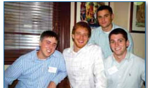
Students keenly anticipating the conference!