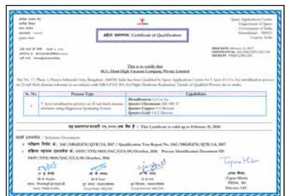
Space Qualification for HMC Metallization