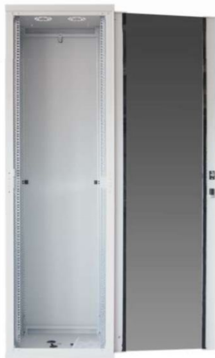
Front View Open