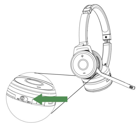
Hold (2 secs) the On/off/connect switch in the connecting position