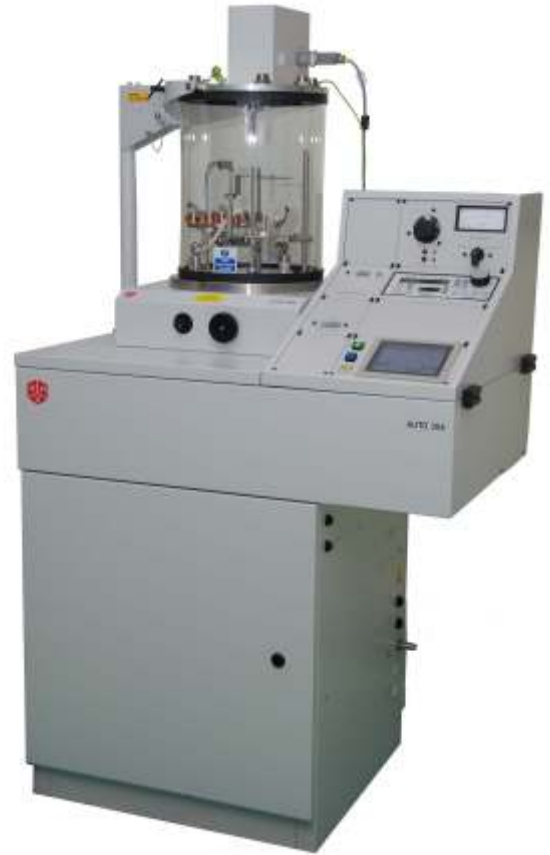
Auto306 for research with glass cylinder chamber and top plate counterbalance