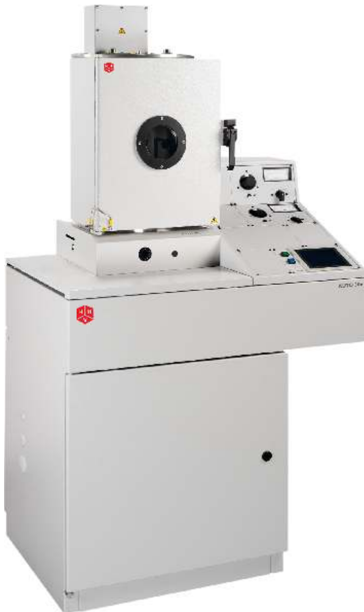
Auto 306 coating system with FL400 front loading chamber

The vacuum system is controlled and monitored by a rugged PLC with touch screen for easy operation. Pumping options include diffusion, turbo and cryo pumps with oil-sealed or dry scroll backing pumps. An integrated high vacuum valve with backup battery protects pumps and samples.