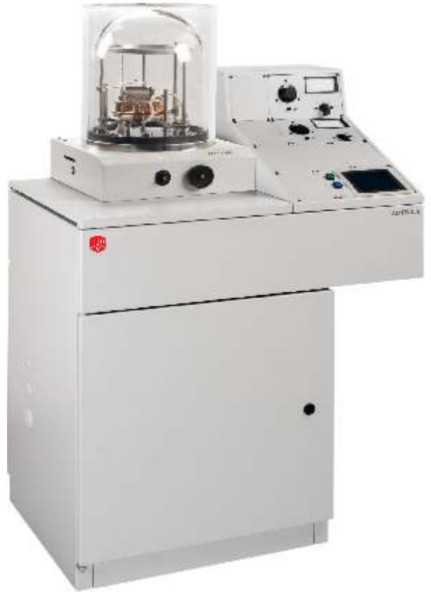
Auto 306 with glass bell jar chamber