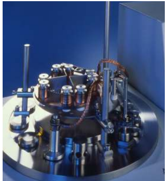
Auto306 with 4-position turret resistance source