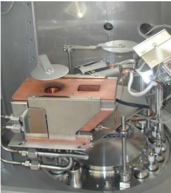
Electron beam source, two resistance sources and quartz lamp substrate heater.