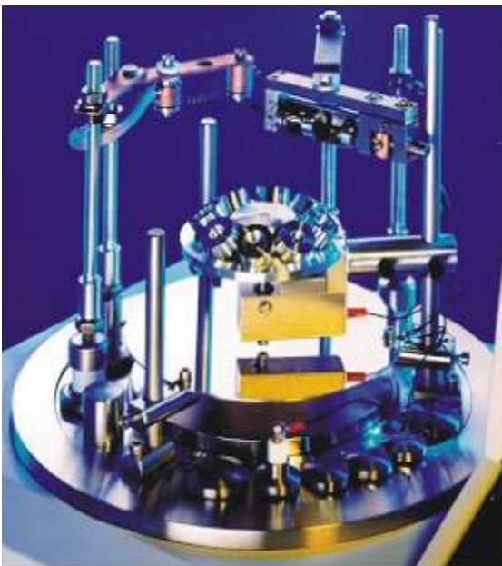
Auto306 by resistance and carbon sources for SEM. The Rotatilt3 work holder is fitted by the SEM planetary sample holder