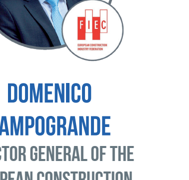
FOR RECONSTRUCTION INDUSTRY FEDERATION (FIEC) AND DEVELOPMENT OF INFRASTRUCTURE OF UKRAINE