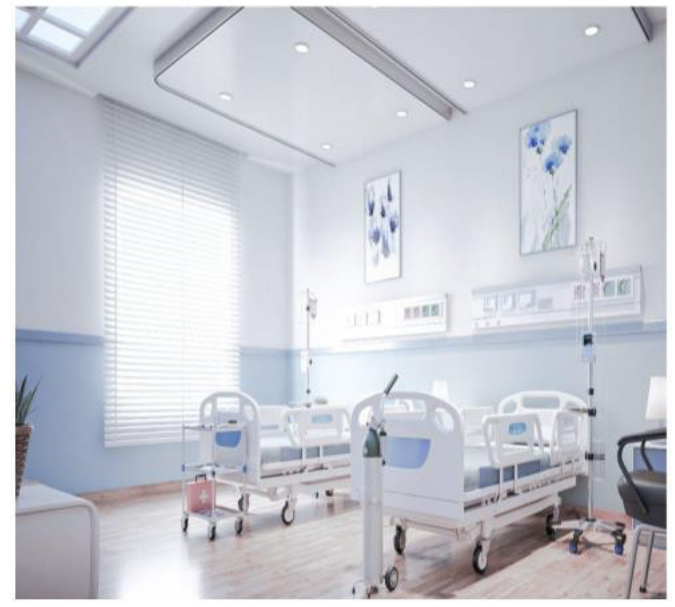
Arrangement of the ward