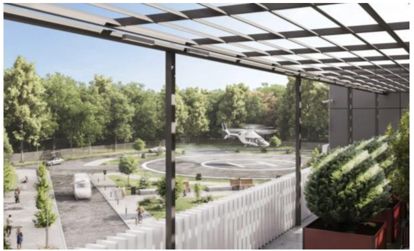
Elements of arrangement of the territory