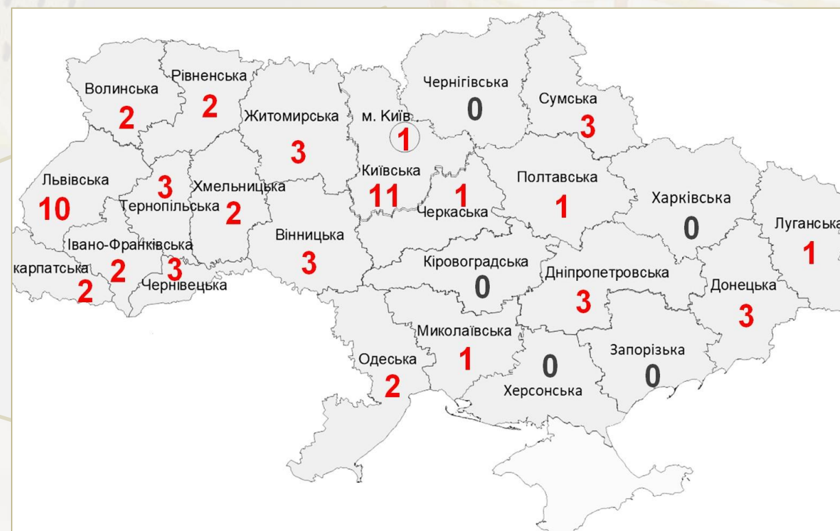
INDUSTRIAL PARK NETWORK IN UKRAINE