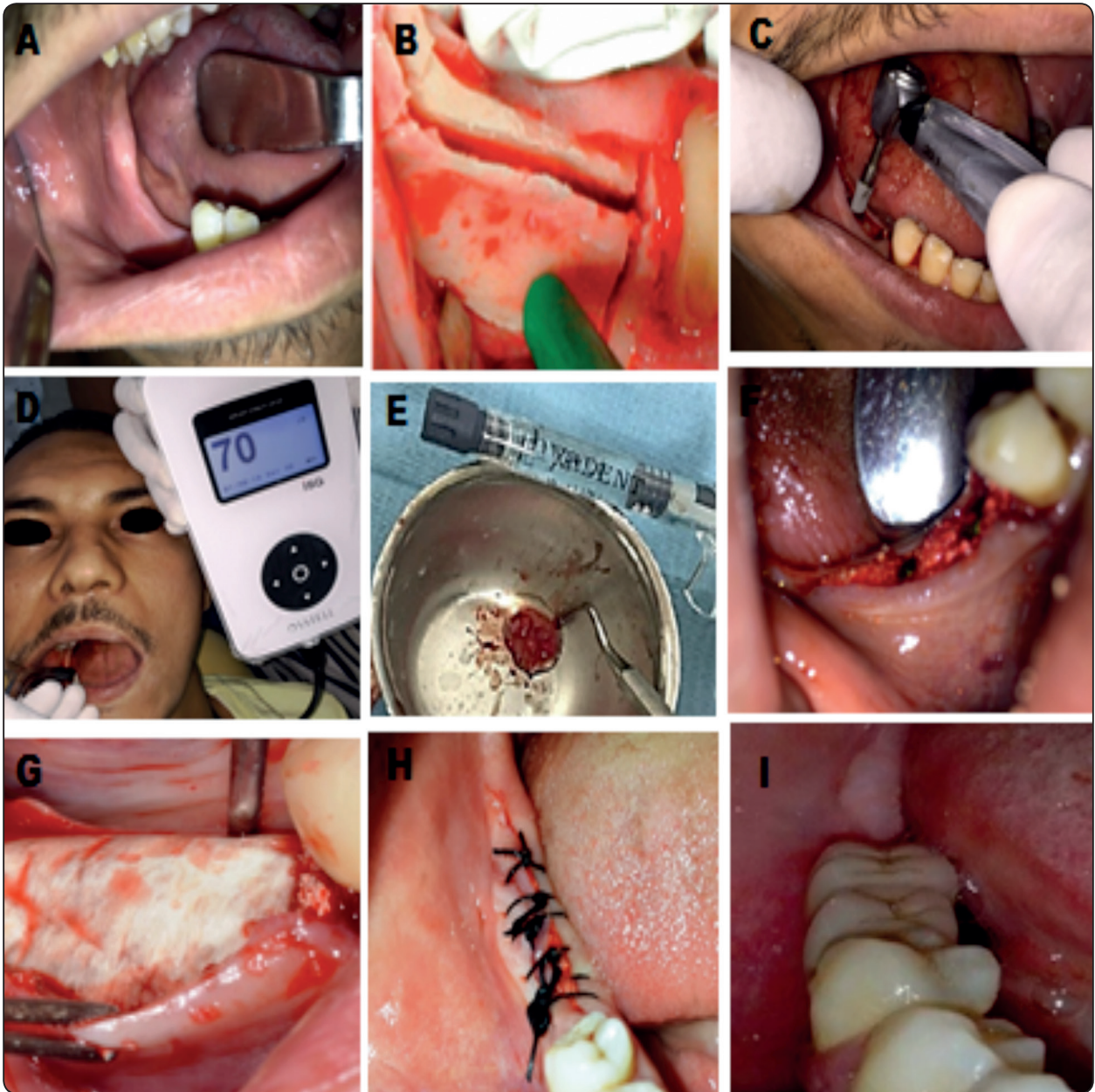
Fig. (1) a) Preoperative intraoral clinical photograph showing narrow posterior alveolar ridge b) Crestal incision and mucoperiosteal flap elevation with crestal and buccal corticotomy by piezotome device c) Dental implant insertion d) Evaluation initial stability by Osstell e) Mixture of osteon II collagen and HyA f) Packing of bone graft mixture in splitted alveolar ridge and around dental implant g) Collagen membrane covering osteon II collagen and HyA mixture and dental implant h) Suturing of mucoperiosteal flap i) Clinical photograph after final prostheses.

automatic selection of all other pixels in the ROI that threshold areas are traced and counted as a number of pixels that can be calculated as a ratio of the whole ROI. Bone density was measured in the day of the implant placement (baseline) and on the follow-up visits at 3, 6, and 12 month.