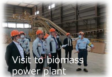
Visit to biomass power plant