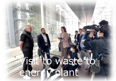
visit to waste to energy plant