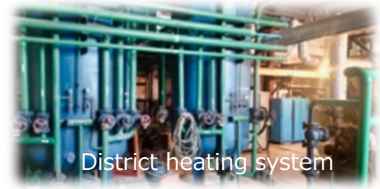
District heating system