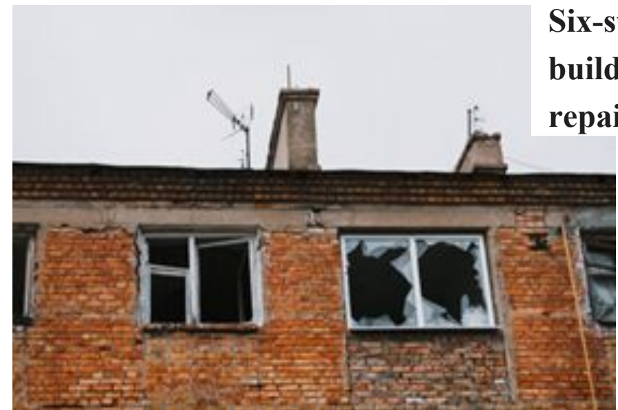
Six-storey buildings repairs