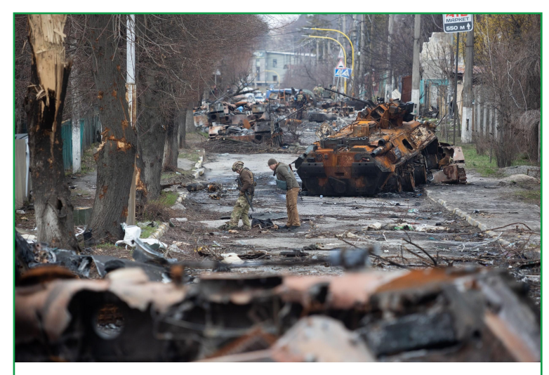
^ BEFORE - Vokzalna Street in April 2022