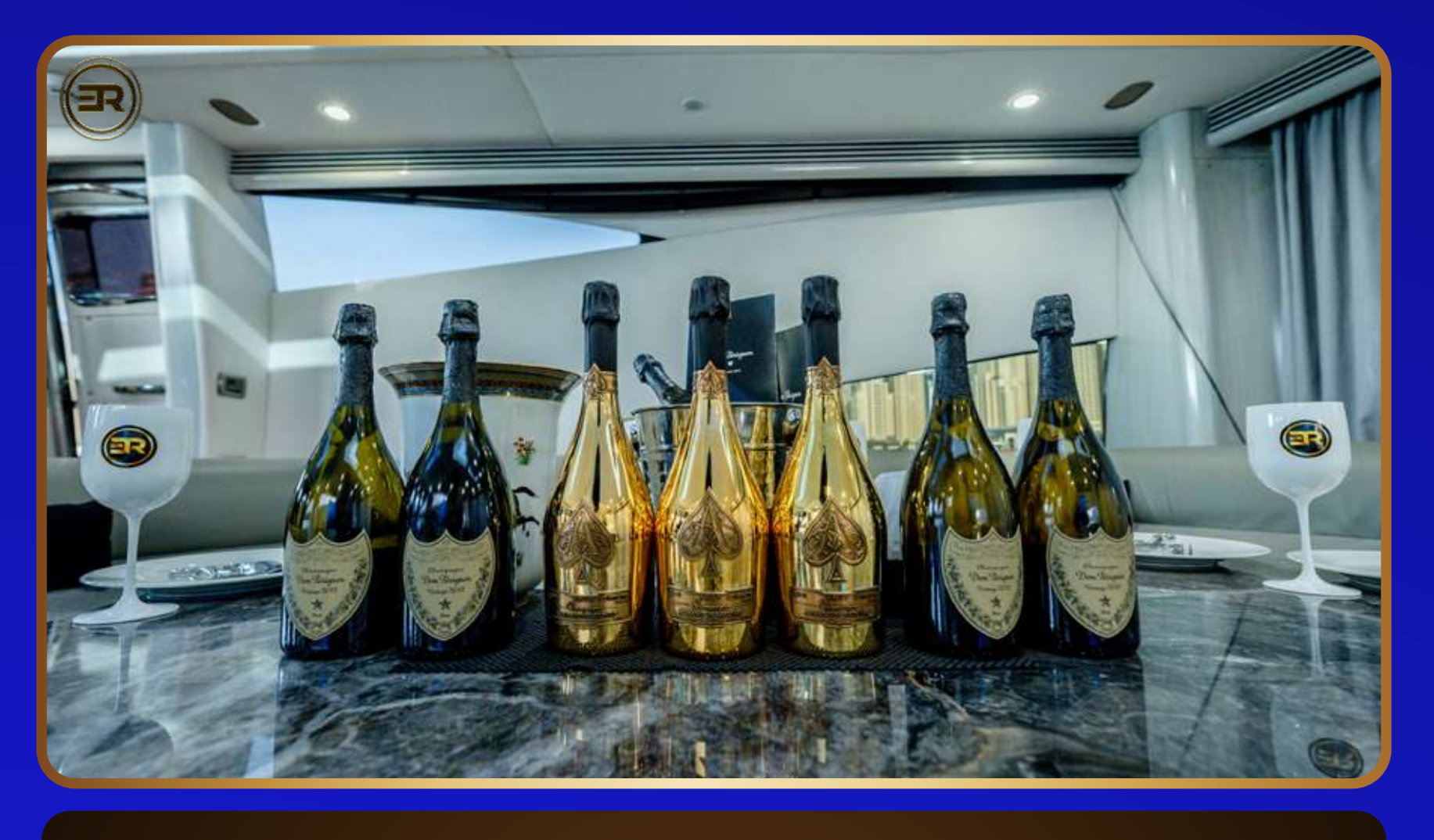
IP guests have the option of a personalized Michelin star menu, showcasing the pinnacle of culinary sophistication.