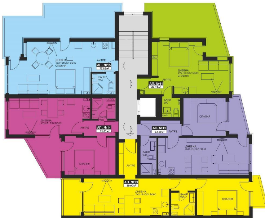
4 РАЗПРЕДЕЛЕНИЕ ЖИЛИЩЕН ЕТАЖ на kota + 8,90