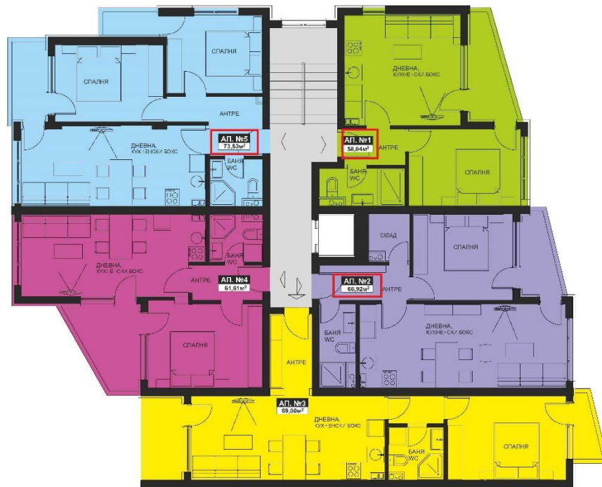
2 РАЗПРЕДЕЛЕНИЕ ЖИЛИЩЕН ЕТАЖ на кота + 3,30