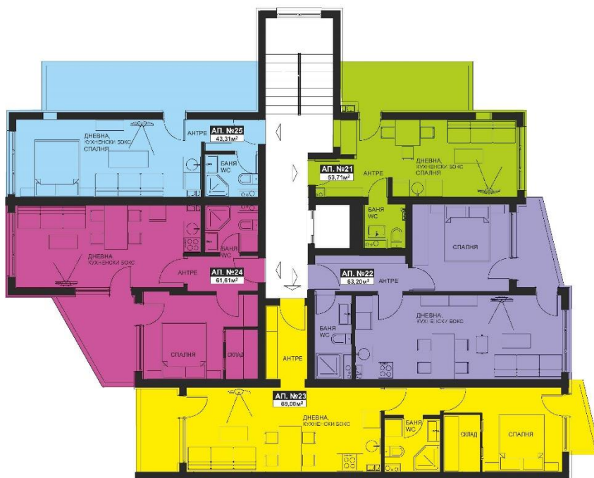
6 РАЗПРЕДЕЛЕНИЕ ЖИЛИЩЕН ЕТАЖ на кота +14,50