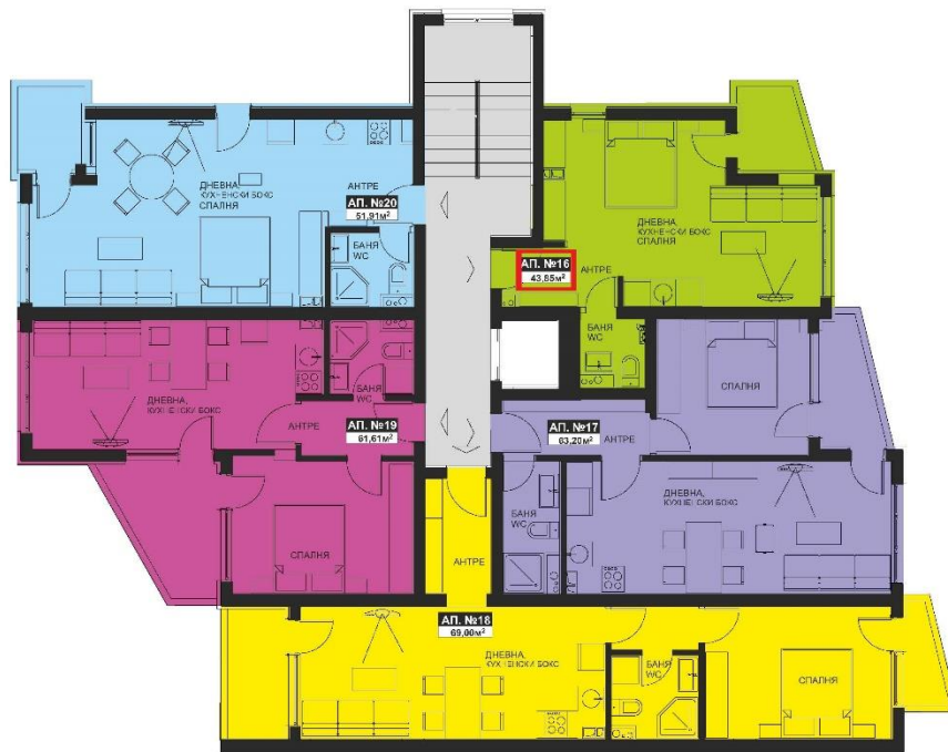
5 РАЗПРЕДЕЛЕНИЕ ЖИЛИЩЕН ЕТАЖ на kota +11,70