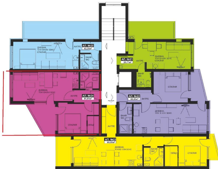
6 РАЗПРЕДЕЛЕНИЕ ЖИЛИЩЕН ЕТАЖ на кота +14,50