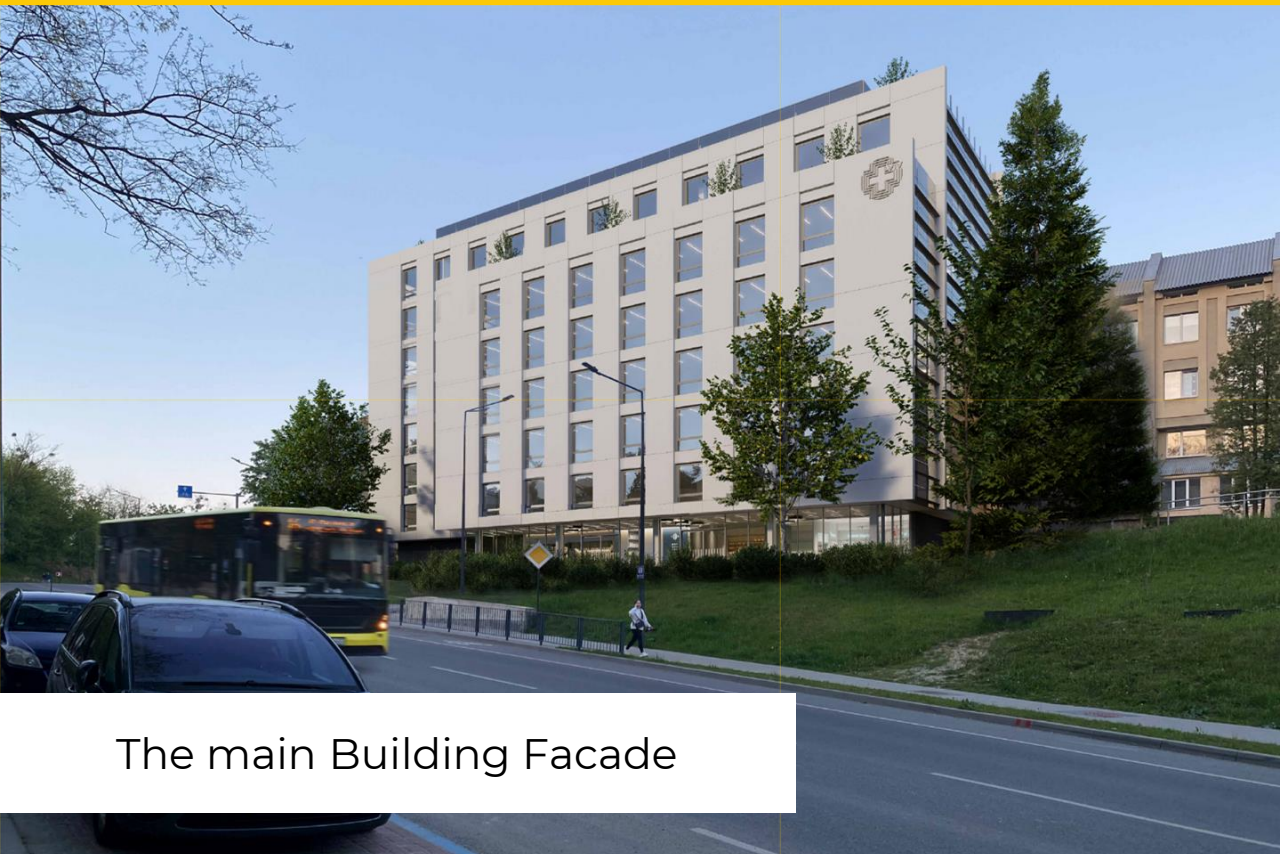
The main Building Facade