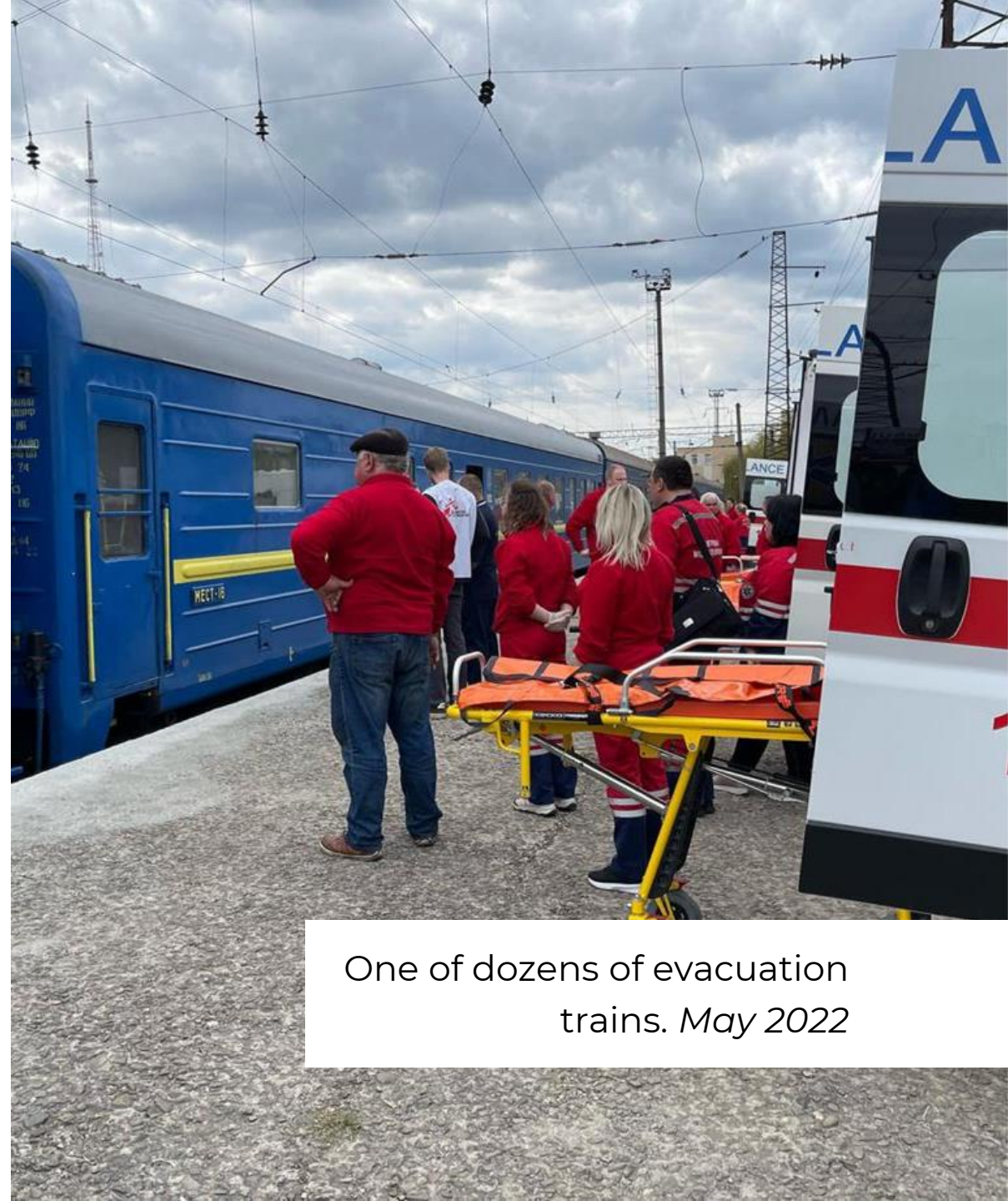
One of dozens of evacuation trains. May 2022

We have become a place of salvation for children from all over Ukraine. This includes treatment, rehabilitation and prosthetics. We also take in displaced children who flee to Lviv from the war.