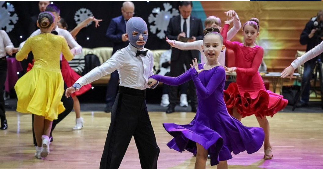
After rehabilitation at a ballroom dance competition

The number of visits to the hospital increased 5 times