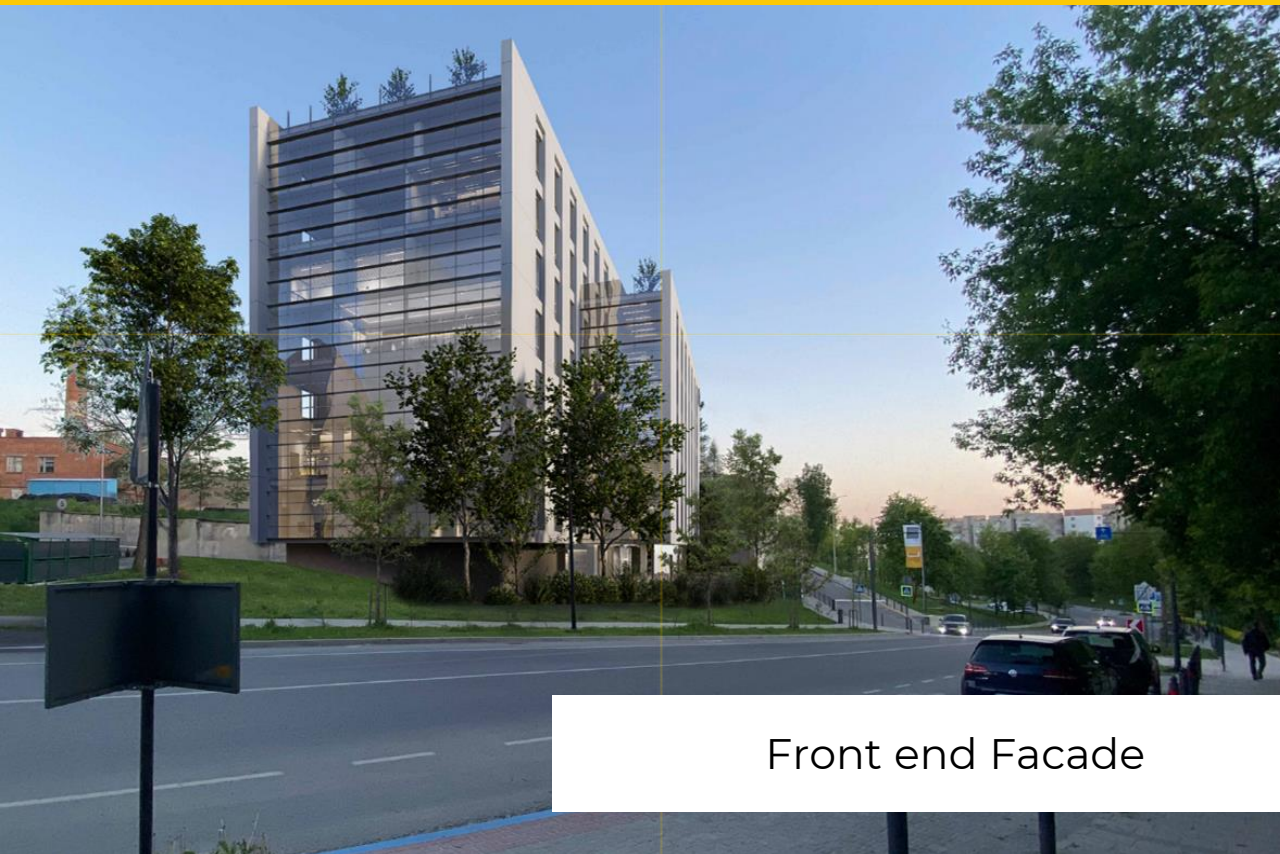
Front end Facade