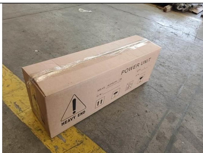
Power packing view