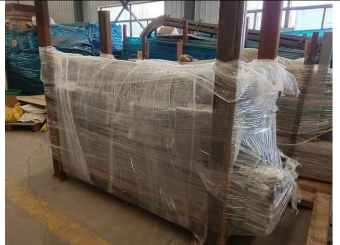
Product packing view