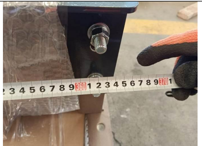
Packing size check