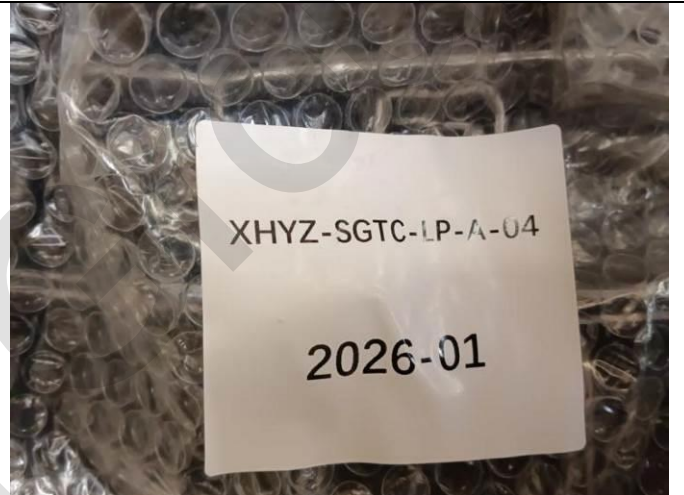
Sticker on packing