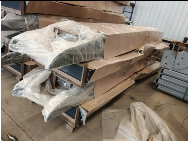
Product packing view