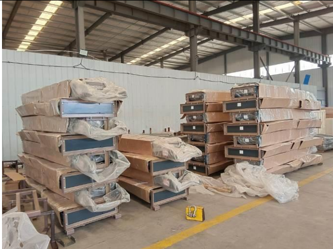
Product packing view