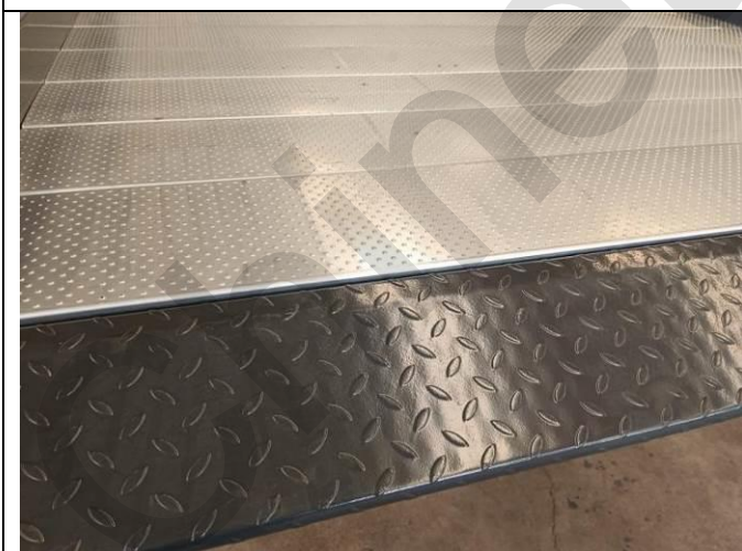
Product details view