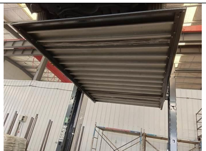
Product details view