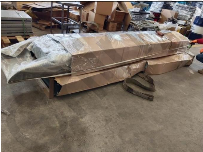
Packing size check