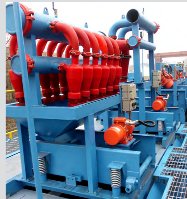
Desander And Desilter