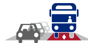
Dedicated Bus Only Lanes (In Select Locations)

Bus only lanes keep travel lanes clear to help them stay on schedule.